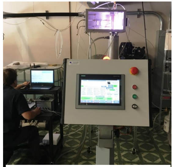
Fig.5. Torch operation and plasma diagnostics by optical spectroscopy