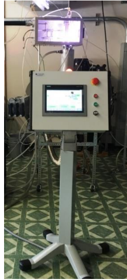
Fig.4. Remote operator's console