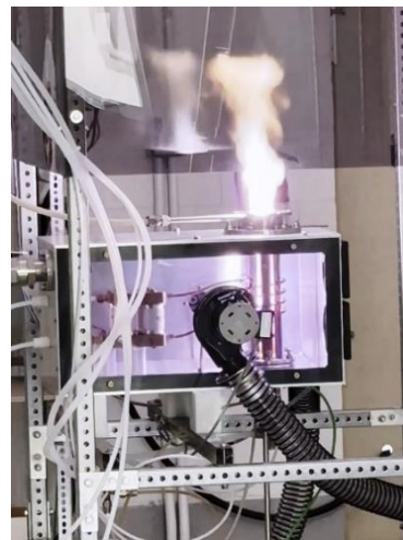
Fig. 6. General view of the plasma system configured for testing TPMs. APT facilities, February, 2024.