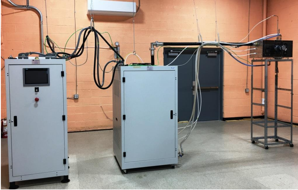
Fig.2. General view of the APT-200-1 plasma system for material tests